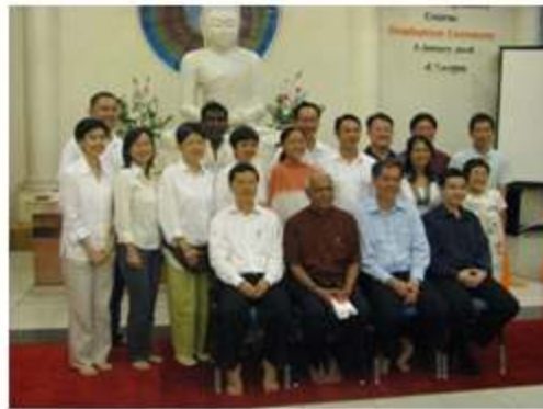
Going forth...to spread the Dhamma far and wide!