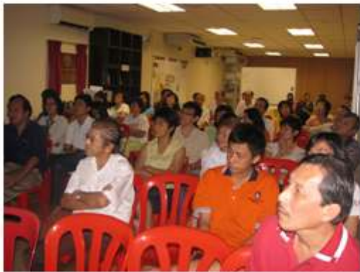
At Ti-Ratana Community Centre, Klang

Sharing the Dhamma also brings me the joy of cultivating the Four Brahmaviharas of metta , karuna , mudita and upekkha . Metta (loving-kindness) to all beings who would benefit from our talks. Karuna to the devotees who trust us enough to share their problems. Mudita , when we share the success and happiness of others, and when others rejoice with us. And Upekkha when things get tough, and the tough must rise up and remain standing. Upekkha is also called upon when everything is running smoothly because we must remember that all conditioned things are impermanent, and change is the only truth in our samsaric existence.