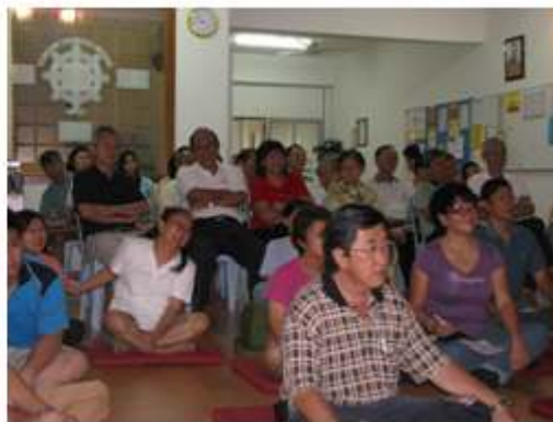
At Mudita Buddhist Society, Klang

Sharing the Dhamma has brought a new meaning into my life. At the end of every talk, I feel a sense of achievement and reward of having done my small bit in propagating the Buddha's sublime teachings to others. And I hope that in doing so, I have managed to plant a Bodhi (awakening) seed in the hearts and minds of my audience so that they would put the Dhamma into practice and realise the joy themselves.