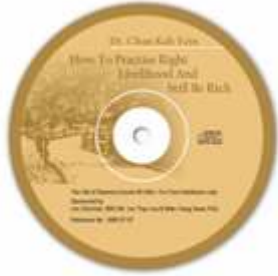
My first Dhamma Audio CD