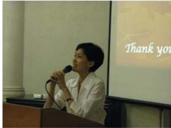
Thank you, everyone.....

As I now begin on my journey as a Dhamma speaker, I remind myself of the Buddha's words, Yo Dhammam desesi. Adikalyanam, Majjhekalyanam, Pariyosanakalyanam . I am thankful that I have been given this beautiful opportunity to continue turning the wheel of the Dhamma , as others have before me.