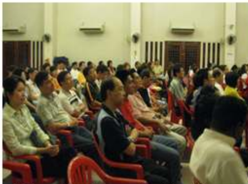
Kalyanamittas who came to rejoice with us.

would have to go out, be on our own, and spend the rest of our lives fulfilling our pledge of sharing the beautiful Buddha- Dhamma with others.