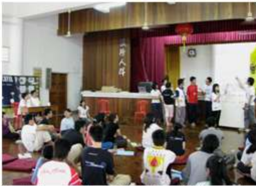
Youth Camp at Klang & Coast Buddhist Association.

While it takes a lot of effort, perseverance and commitment to become a Dhamma speaker, the joys and rewards are tremendous. Not only have I learnt so much more in my own knowledge and experience of practising the Dhamma , I also find myself practising certain aspects of the Ten Paramis such as viriya (effort), sacca (honesty) and aditthana (determination).