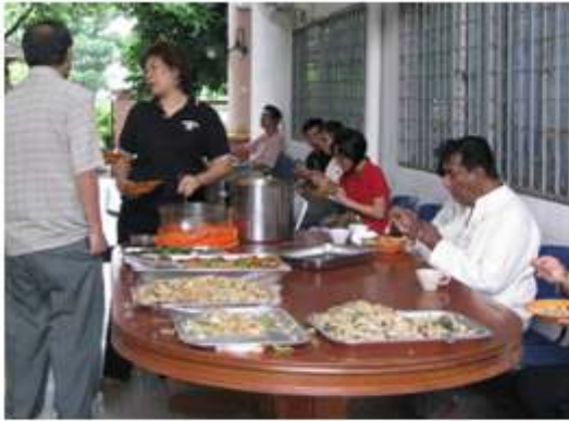
Food, Glorious Food!

The graduation of the UMDF's 1 st Dhamma Speakers Course was to be held in January 2008. After two long years, fourteen of us who had fulfilled the minimum requirements would be allowed to graduate. We planned eagerly for the ceremony. We would have an organic vegetarian dinner – as our gift to our coordinators, our mentors and all our supporters from the various Buddhist societies. They had given us something priceless – their time, energy, love and commitment. We would never be able to give them anything else to reciprocate their priceless gift to us. Since the Buddha said that “Health is the Greatest Gain”, we shall give them good health then!