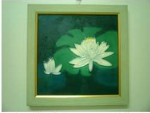
The painting that hangs on my wall. A reminder...to be like the lotus.

Shortly after I started giving talks, my husband bought me a gift from one of his overseas trips. It was a beautiful painting of a lotus. It hangs on my wall, right above my computer, where I spend hours studying the Dhamma and preparing all my talks.