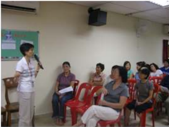
At "home", in Ti-Ratana, Klang, where is there an endless flow of love and warmth.