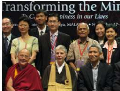
One for the album. An experience of a lifetime.

The 5 th global conference was a resounding success in every way. Everyone came away with a great sense of having learnt something new, and being inspired to put the sublime teachings into real-life practice. I was very thankful to be a part of this event. I count this as another memorable milestone in my life.