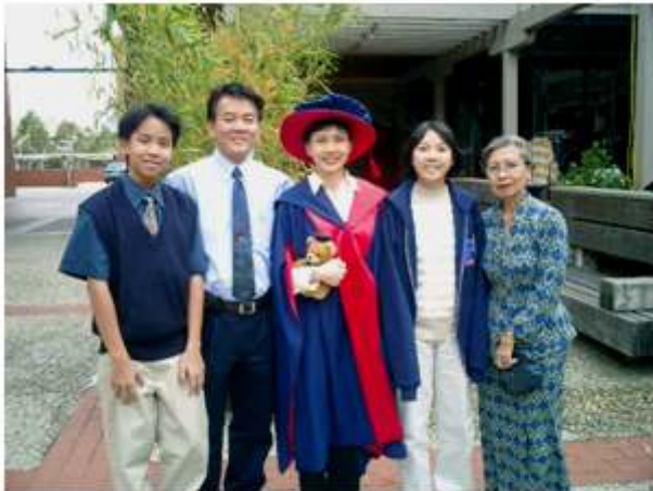
My family with me at my Ph.D. graduation, October 2004.

It was very hard at the beginning. As a mother of two relatively young children, my life was already packed to the brim with household chores and responsibilities. I would go to work in the morning, rush back with lunch for one child, then take him to school and fetch the other back from school. Then, it was often the endless rounds of ferrying them to and fro until late at night. This was of course thanks to the ubiquitous tuition classes, a malady that has afflicted modern-day society due to sad and uncontrollable circumstances (and this issue can be a topic for another book which I shall certainly not attempt to write!). Besides being an unpaid chauffeur, I also had to run errands, clean the house, cook – well, pretty much everything that a modern-day working mother has to do. I had no domestic helper too.