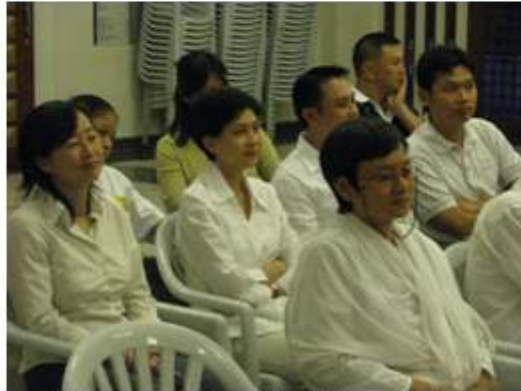
All of us dressed in white, in the spirit of camaraderie.