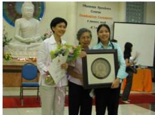
One for the family album - my mother, my daughter and me.