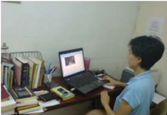
Researching late into the night AND hounding mentors with questions, through the email.