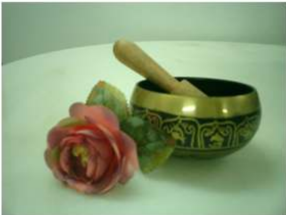
My singing bowl.