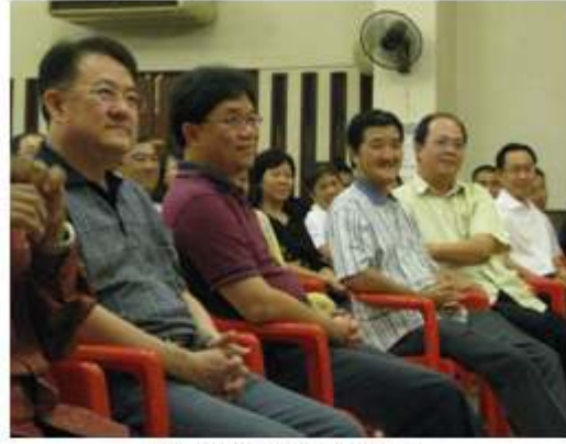
Our mentors and friends.