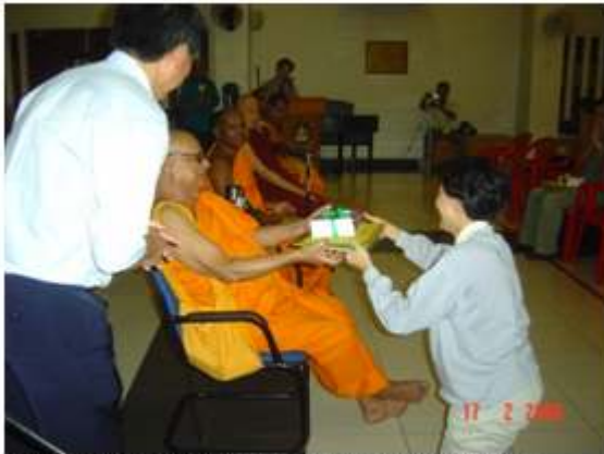
Receiving my books from Chief. Notice the two layers of clothing?

So I wrapped myself in two layers of clothing and armed with a small towel (in case I needed to sponge myself if my fever ran too high), I drove to SJBA that evening. I registered, made my way into the hall, found a chair amongst the participants' seats and slumped onto it. Luckily I did not faint – my fever was at its all time high. Wrapped up in thick layers of clothing, I could have easily passed off as an Eskimo girl that night.