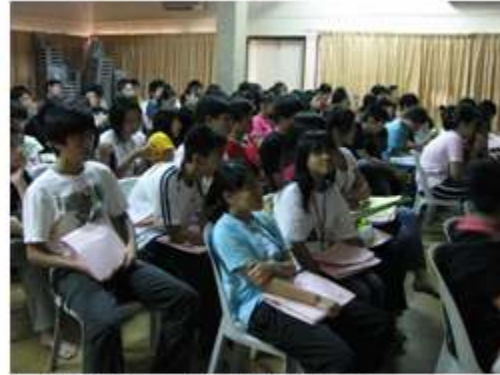
Youth Camp at Buddhist Maha Vihara.

Sharing the Dhamma also brings me the joy of cultivating the Four Brahmaviharas of metta , karuna , mudita and upekkha . Metta (loving-kindness) to all beings who would benefit from our talks. Karuna to the devotees who trust us enough to share their problems. Mudita , when we share the success and happiness of others, and when others rejoice with us. And Upekkha when things get tough, and the tough must rise up and remain standing. Upekkha is also called upon when everything is running smoothly because we must remember that all conditioned things are impermanent, and change is the only truth in our samsaric existence.